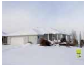
Stony Plain $599,900