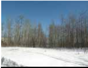
Parkland County $129,000