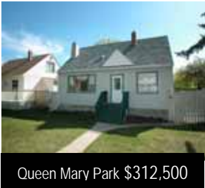
Queen Mary Park $312,500