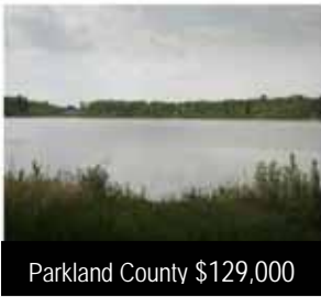
Parkland County $129,000