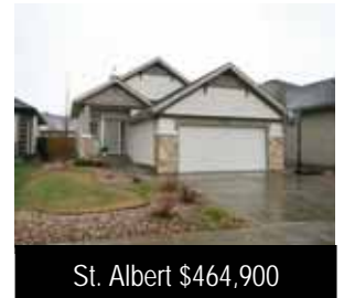
St. Albert $464,900