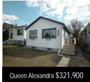
Queen Alexandra $321,900