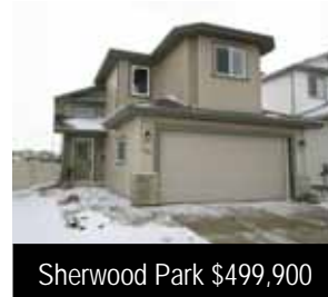
Sherwood Park $499,900