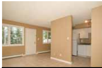
Lorelei $189,900 www.Unit114-16428-109street.com