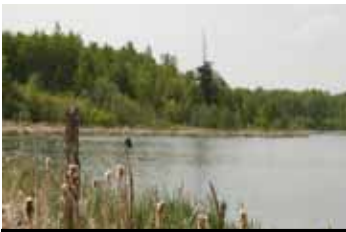
Parkland County $129,000 www.20-53102-RR31.com