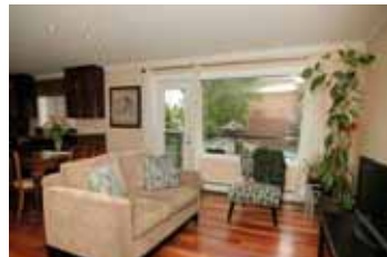
Garneau $289,900 www.Unit6-8304-107street.com