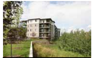
Canon Ridge $189,999 www.Unit212-1188-HyndmanRd.com