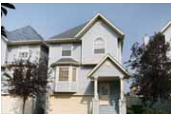
Jackson Heights $294,900 www.113-1670-JamhaRoad.com