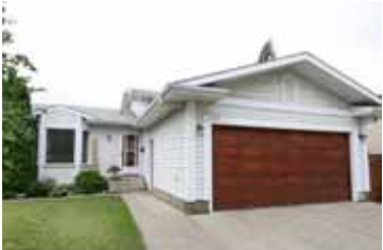
Duggan $399,000 www.4012-105B-Street.com