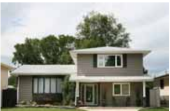
Duggan $489,900 www.3616-106AStreet.com