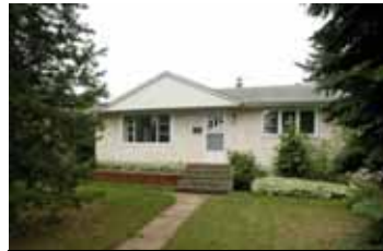
Avonmore $324,900 www.8131-76ave.com