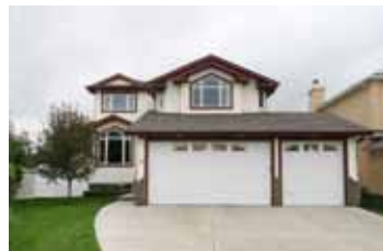
Beaumont $499,900 12-BrochuCourt-Beaumont.com