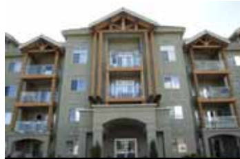
Suder Greens $224,900 Unit139-278-SuderGreensDrive.com