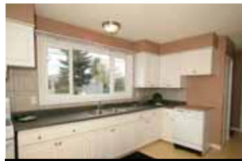
Kensington $179,845 www.13310-113A-Street.com