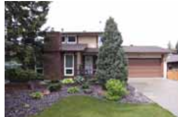
Sweet Grass $439,900 www.11623-32A-Ave.com