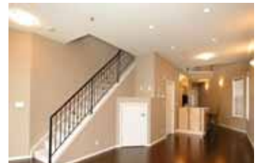
Empire Park $289,900 Unit400-4835-104A-Street.com