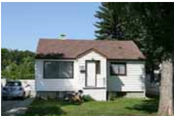
Beverly Heights $274,900 www.4038-114avenue.com