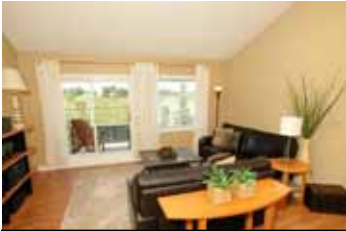
Callingwood $214,900 www.62-6220-172street.com