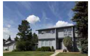
Lansdowne $549,900 www.5112-123street.com

Wondering what homes in YOUR neighborhood are selling for? Visit our website and click on 'What's My Home Worth?'