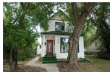
Strathcona $499,900 www.9851-86ave.com