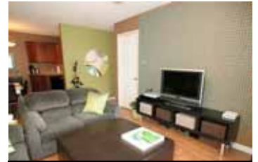
Oliver $260,000 www.Unit205-10326-117street.com