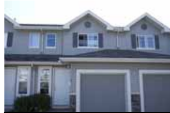
Ellerslie $259,888 www.10-230-EdwardsDrive-SW.com