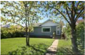
Strathearn $324,900 www.8611-95ave.com