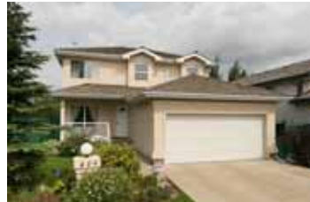
Blackburne $424,900 409-BlackburnDriveEast-SW.com