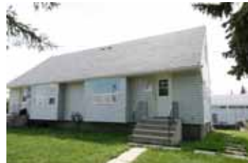
Hay Lakes $350,000 116-118-MainStreet-HayLakes.com