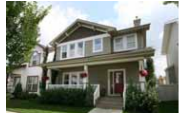
Terwillegar Towne $449,900 www.5089-ThibaultWay.com