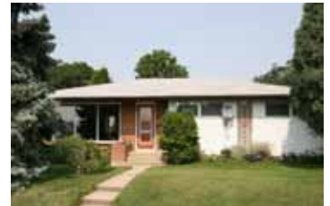
Lendrum Place $374,900 www.11308-55ave.com