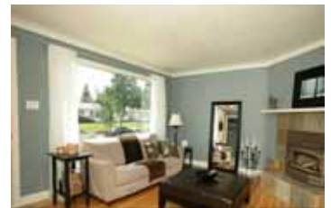
North Glenora $319,900 www.10962-141street.com