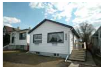
Queen Alexandra $318,900 www.10721-73ave.com