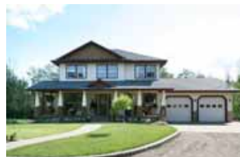
Sherwood Park $889,900 51063-RR203-SherwoodPark.com

Take a look at the videos for each of these properties by visiting their individual property websites and clicking on 'Video' on the left