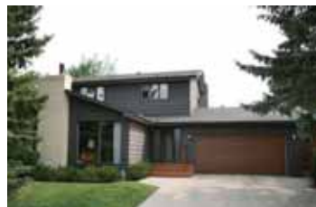
Aspen Gardens $574,900 www.12403-40ave.com